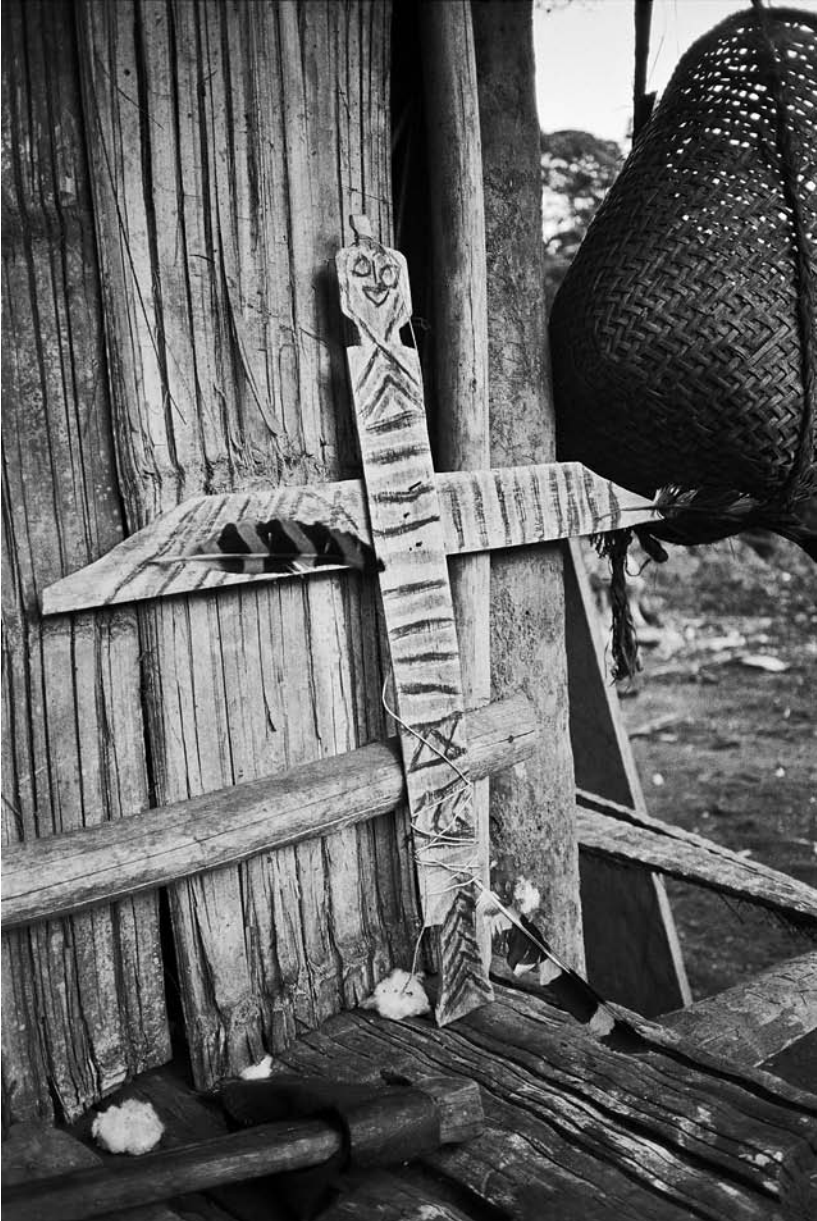
FIGURE 5. What a hawk looks like to a parakeet.