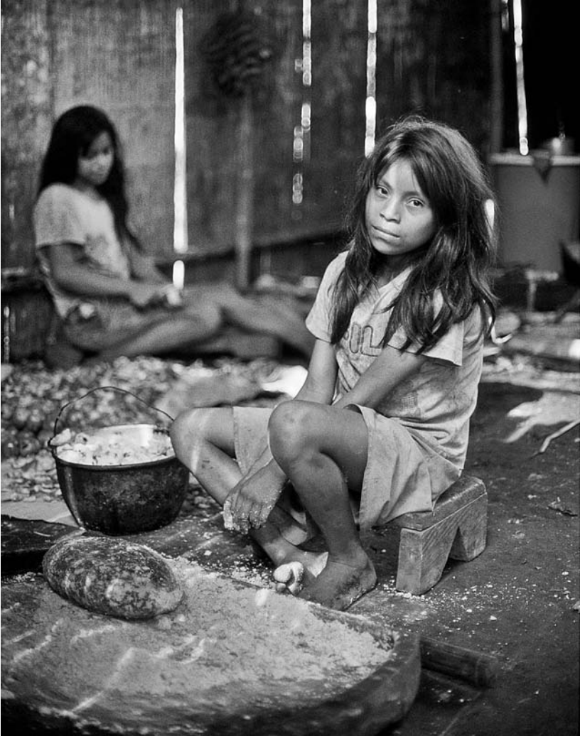
FIGURE 8. “Granddaughters” preparing peach palm beer ( chunda asua ).

the spirit masters of the forest—is that they create a domain of circular causality in which the things that have already happened have never not happened. Take the English language, for example. We know that any given sentence might include words of, say, Greek, or Latin, or French, or German origin, but these histories are irrelevant to the “timeless” way such words come to give each other meaning by virtue of the circular closure of the linguistic system of